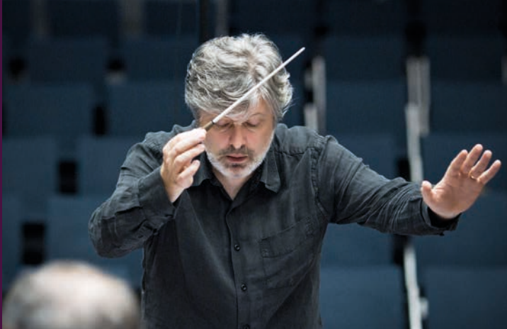
Sir James MacMillan

Holy Week Festival will be on sale from Monday 19 November 2018 .