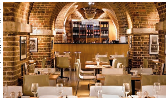
Footstool Restaurant