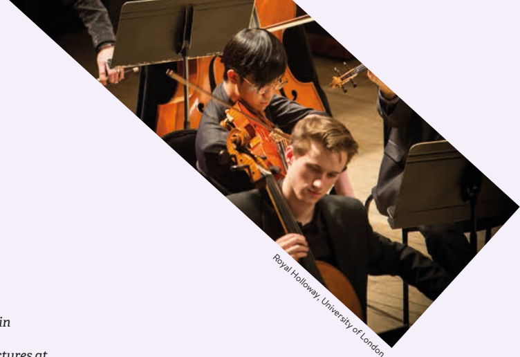
Royal Holloway, University of London