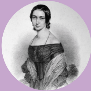
Clara Schumann