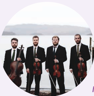
Maxwell Quartet