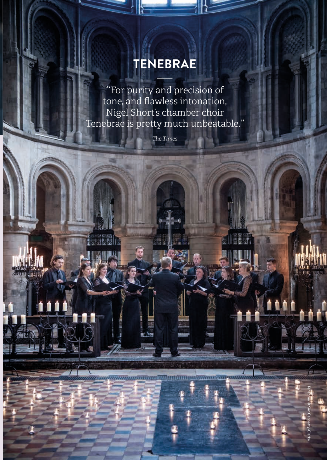
Tenebrae © Sim Carnethy-Clarke