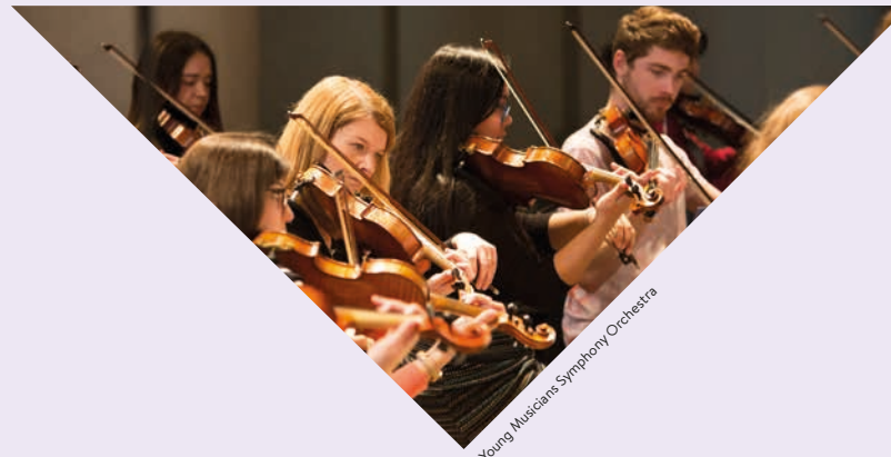
Young Musicians Symphony Orchestra

£15 (10% off), 20% off when booking for 3 or more concerts in the series