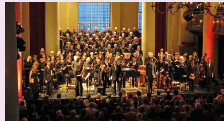
Crouch End Festival Chorus