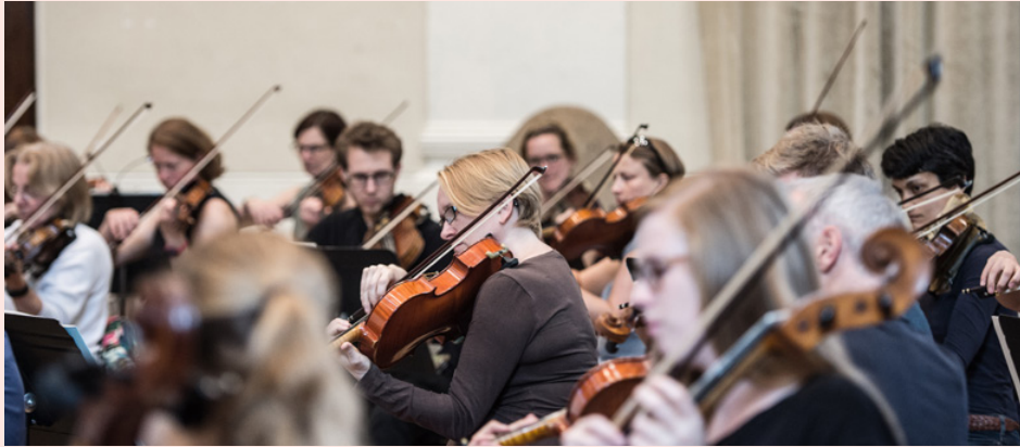
Kensington Symphony Orchestra