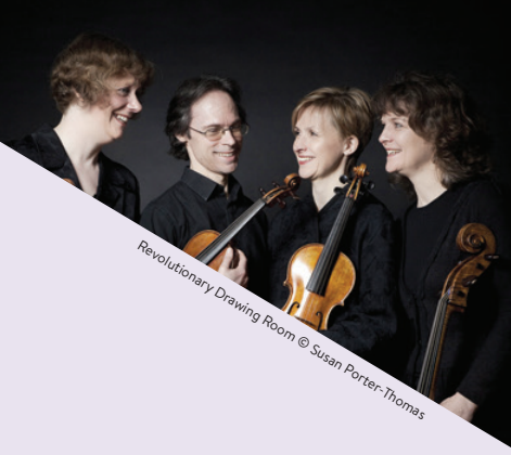
Revolutionary Drawing Room © Susan Porter-Thomas