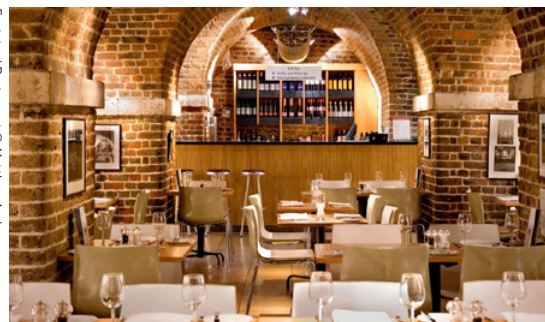
Footstool Restaurant