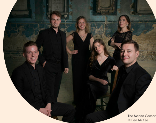
The Marian Consort