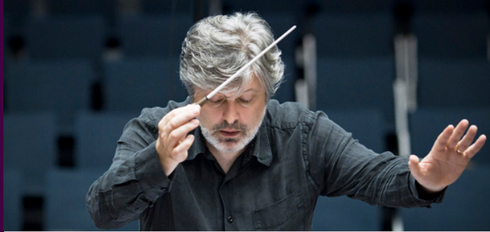
Sir James MacMillan