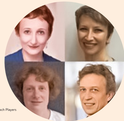
The Bach Players

10% off tickets to The Bach Players' evening concert when booked in the same transaction