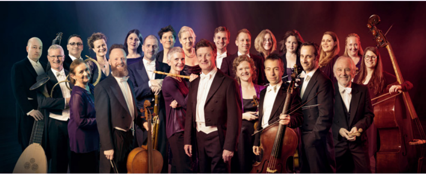
The English Concert