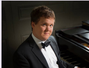
Frederic Bager © Celine Michel