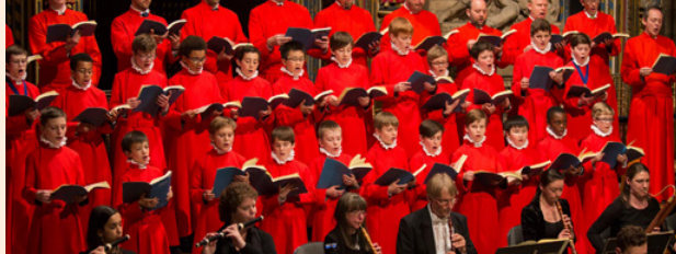
The Choir of Westminster Abbey

Sun 12 May 7.30pm £45, £35, £25, £15, YF