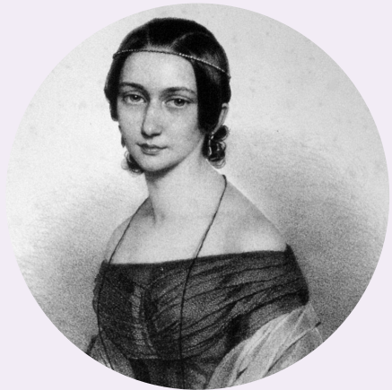
Clara Schumann