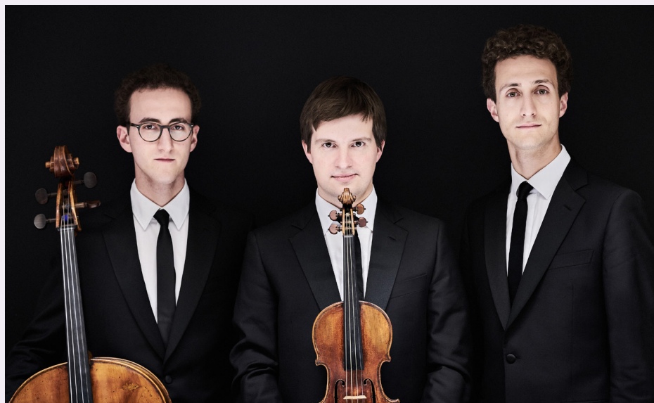
The Busch Trio