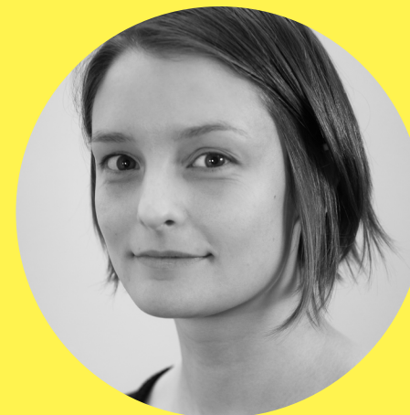
Siwan Rhys