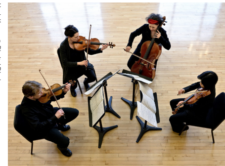
Bozzini Quartet