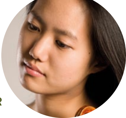
Joo Yeon Sir